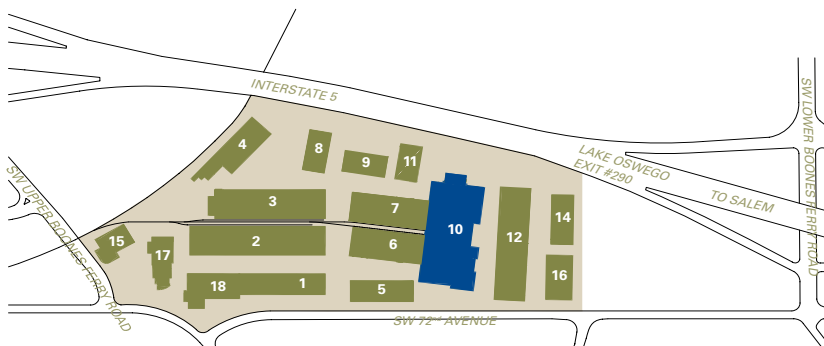
OREGON BUSINESS PARK I Portland, Oregon 97224