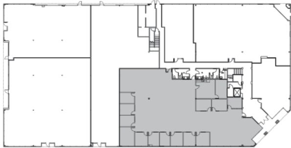
SUBJECT BUILDING PLAN