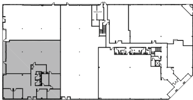
SUBJECT BUILDING PLAN