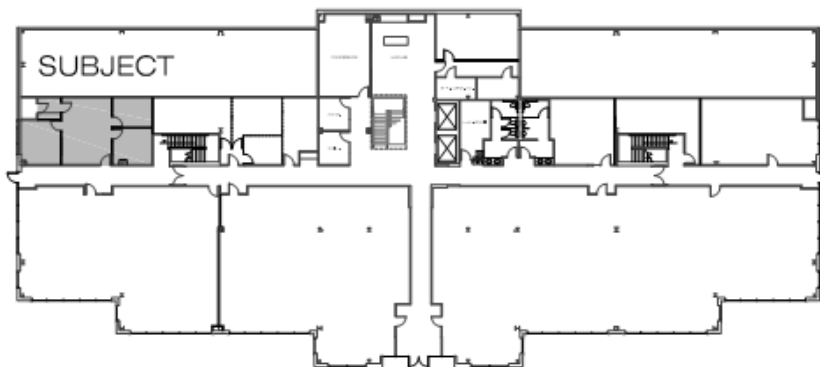
BUILDING KEY PLAN NOT TO SCALE